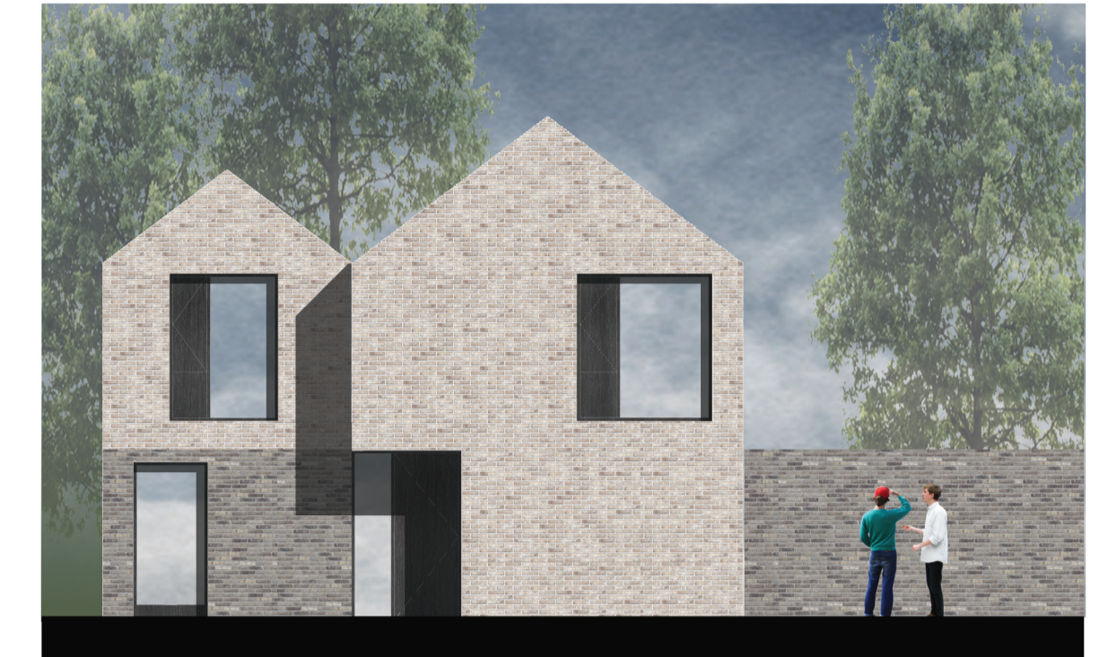
3 House Type C - Indicative Material Study