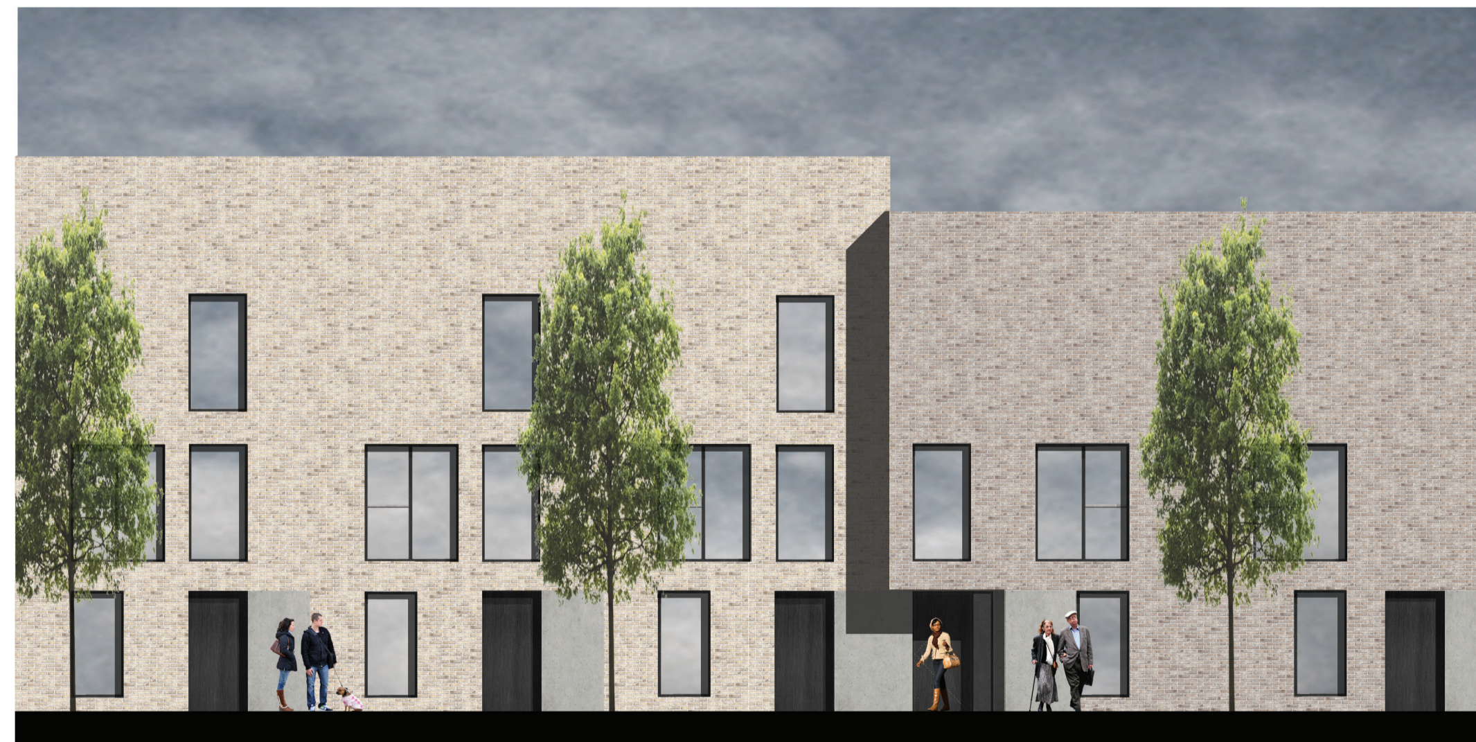
5 Terrace Houses - Indicative Material Study