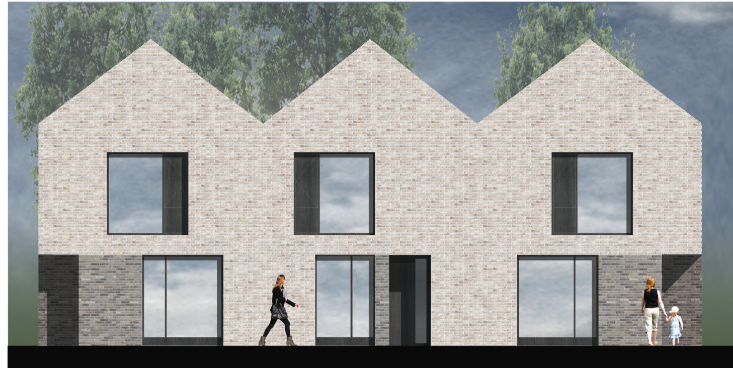
1 House Type A - Indicative Material Study