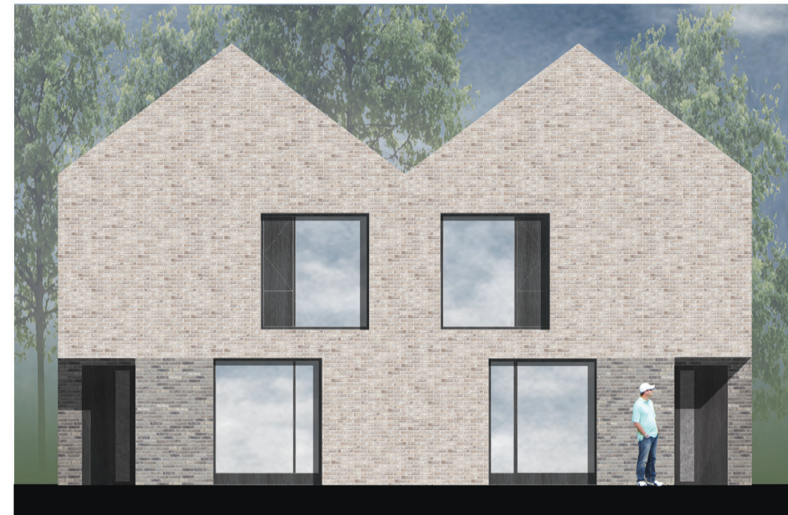
2 House Type B - Indicative Material Study