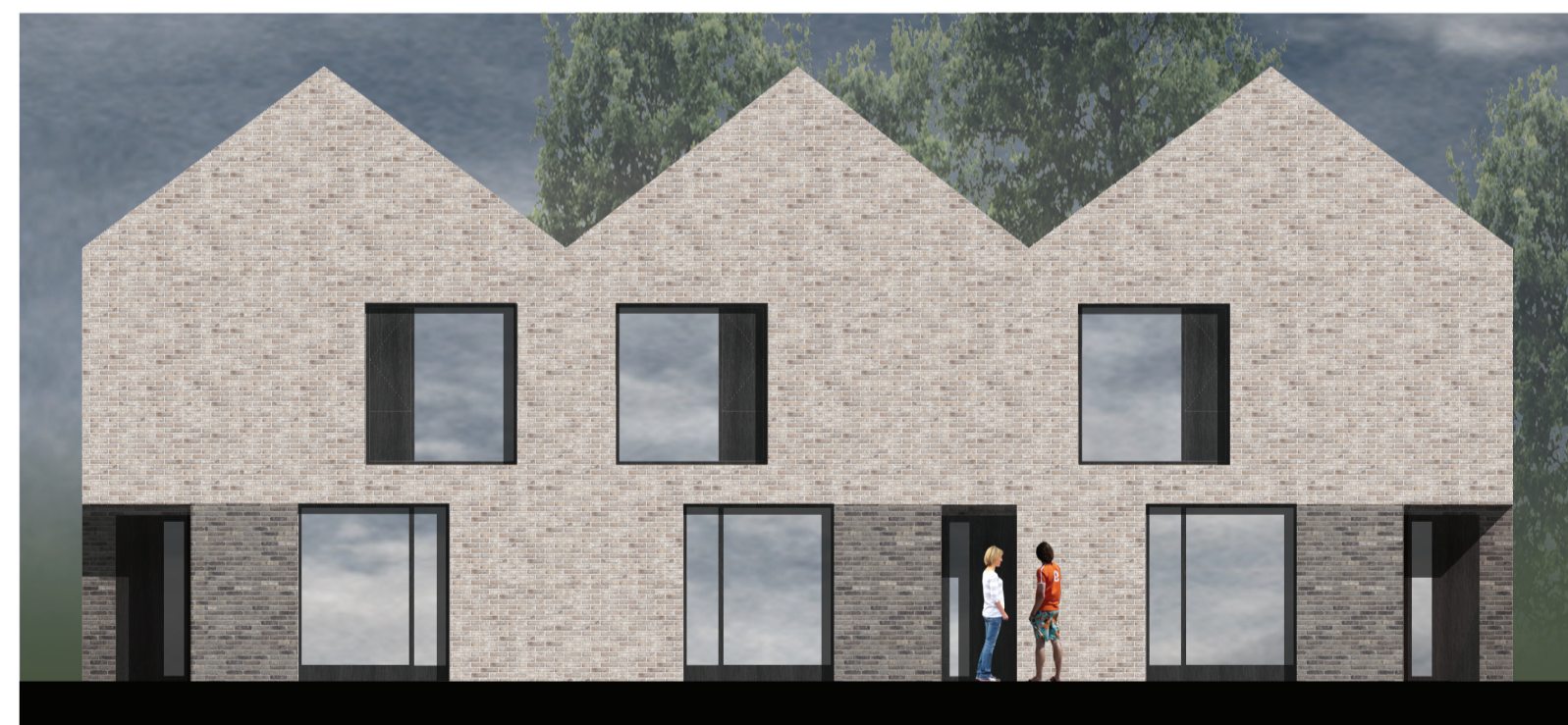
4 House Type D - Indicative Material Study